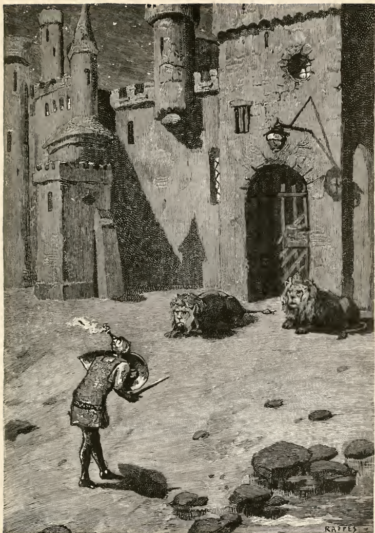
Sir Lancelot at the Castle of the Holy Grail.